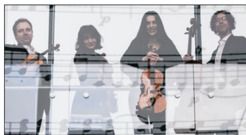
RTÉ Contempo Quartet