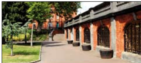
Dublin Literary New Music Trail