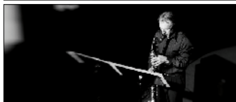
Solo Series Live Concert Tour