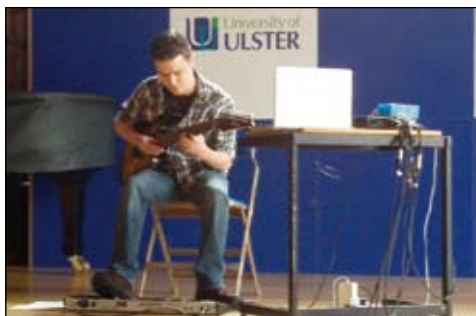
New Music Student Marathon

CMC's new music :: new Ireland Salon Series