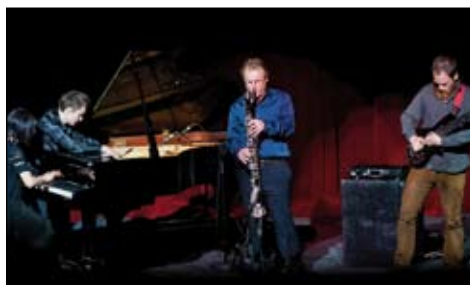
Solo Series Live Concert Tour