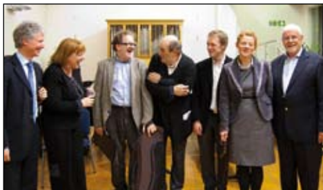
Frederick May Celebration

CMC's new music :: new Ireland Salon Series